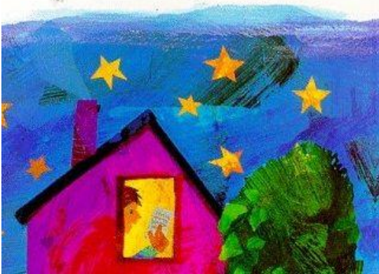
The Secret Birthday Message By Eric Carle

Use with control to pour, hammer and make marks.